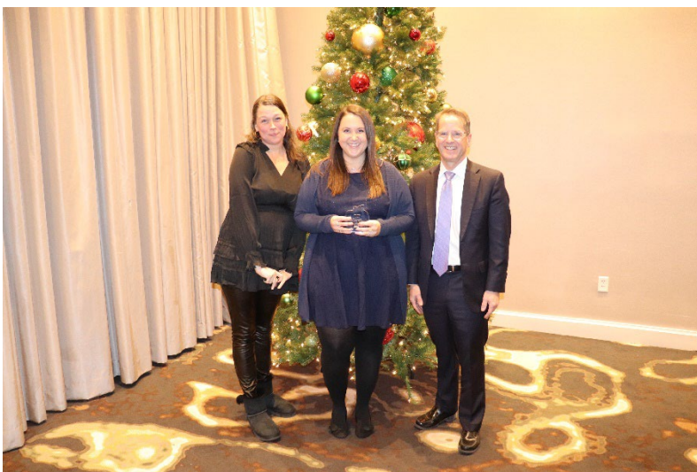
Justine Dube Parker-Varney Elementary School