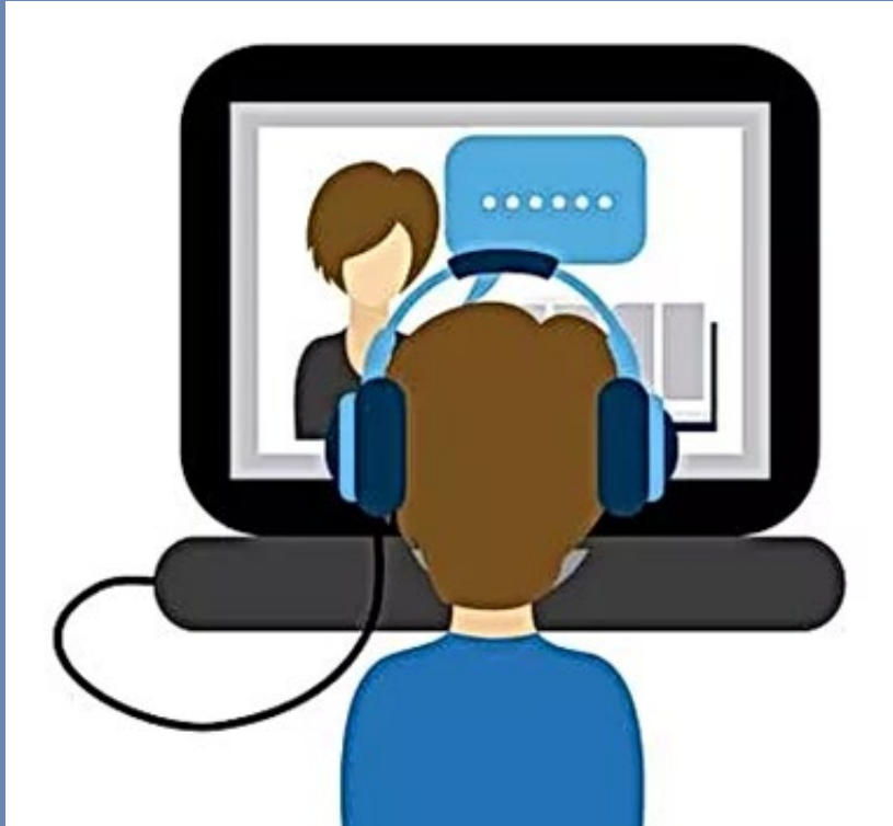
2020-2021 HYBRID MODEL 6 TH GRADE SAMPLE STUDENT SCHEDULE – A COHORT