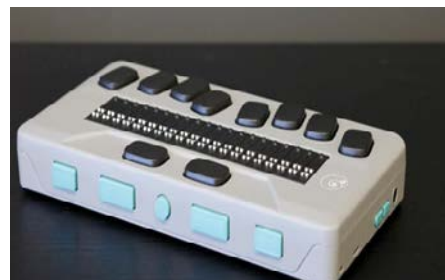
Chameleon 20 Portable braille display

Bookshare is free for U.S. students with qualifying disabilities. Educators can sign up qualified students and provide unlimited access to books, students can also sign up for a free individual membership.