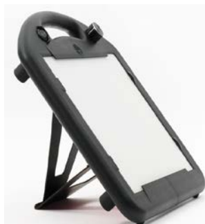
LED Mini-Lite Box

Bookshare is free for U.S. students with qualifying disabilities. Educators can sign up qualified students and provide unlimited access to books, students can also sign up for a free individual membership.