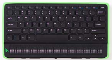
Mantis Q40 a Bluetooth keyboard and 40-cell refreshable braille display

NHAEM is in the beginning phases for the 2021 Federal Quota Census to Promote the Education of the Blind. NHAEM encourages school districts and teachers of the visually impaired to begin conversations to ensure all eligible students will be registered on the 2021 Federal Quota Census.